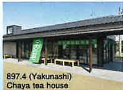
897.4 (Yakunashi) Chaya tea house

Horai bashi Bridge was originally built for agricultural use in 1879 by the farmers who cultivated Makinohara Heights. It then began to be used as a community bridge connecting Hatsukura and Shimada. Nowadays, this toll bridge solely for pedestrians and bicyclists has become one of Shimada's main tourist spots. With a length of 897.4 meters (approx. 0.6mile) and width of 2.4 meters (approx. 8feet) Horai bashi Bridge is listed in the Guinness Book of Records as the world's longest wooden footbridge. It creates a fantasy world when it is lit up at night. A tea shop called "897.4 (Yakunashi) Chaya tea house" opened at the foot of the bridge in 2018. This tea house offers Shimada's quality tea and various local products.