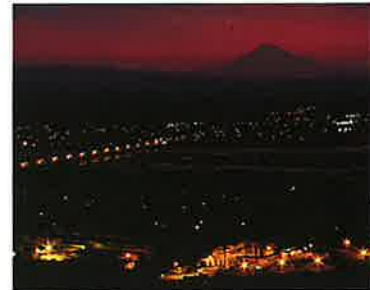
Access: 1701-1 Kanaya Fujimi-cho, Shimada City 5 mins drive from JR Kanaya Station

The Kanaya-Shimada townscape and Oi-River are blessed with sweeping views of Mt. Fuji, Suruga Bay, Izu Peninsula and the Southern Alps in the distance. In Makinohara Park there is a statue of the tea ceremony master Eisai Zenji, recognized for his contribution to the history of the tea drinking culture in Japan. Further, from late March to early April fawn lilies, city's natural treasure, bloom in bright clusters on the park slopes. The night view from Makinohara Park is also registered as "Japan Night View Scenic Heritage".