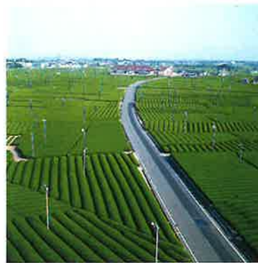
Access: Tea Museum, Shizuoka 3053-2 Kanayafujimi-cho, Shimada City